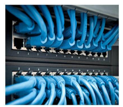
Fig.3. local area networks (WANs) Connection

Wi-Fi: Networking is playing vital role in current IT era where data distribution and access is critically important. As the use of communication between two or more entities increases the networking technologies need to be improved and refurbished over time. Similarly the transmission media, the heart of a network, has been changed with the time improving on the previous one. If you know a little bit about networking you surely have heard the term WIFI which is currently the dominant network technology. Wide spread of the WIFI technology made most of the offices, universities and buildings use the technology for establishment of local area networks (LANs).